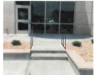
Hand Rails South and East sides.

May include marble or wrought iron benches as sponsored additions