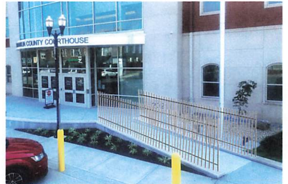
Hand Rails are needed to avoid risk for visitors.

The entire Northwest section would include a concrete access on the South entry with a walkway around the section. The inner part of the section would be brick pavers. All grass would be removed.