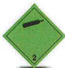
Non-Flammable Non-Toxic Gases