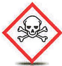
Acute Toxicity Hazard