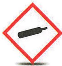
Compressed Gas Hazard