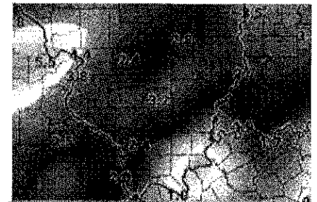
Projected Rainfall for WED-THURS